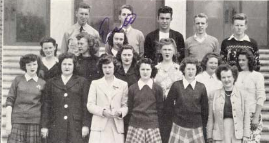
The lower sides of the Journal, drop into suggestion box outside of Main Office

They are not sure as yet as to what kind of life they want that kind of a life. They are sure that they will get a lot of fun out of it. It is a very interesting job and they are sure to get a lot of fun out of it.